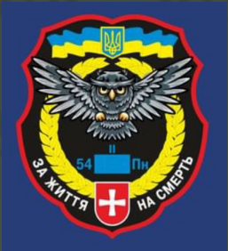
the 54th Separate Reconnaissance Battalion